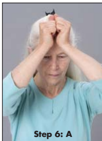
Step 6: A

6. For the nose rub, form the hands into fists with thumbs outstretched. Hold the fists together so the backs of the thumbs are facing you. Start with the heels of the thumbs at the hairline above the forehead and rub lightly down the face, parting the thumbs to go to either side