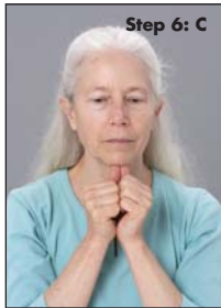
Step 6: C

of the nose, then rejoining to finish with the tips of the thumbs under the chin. Do this twelve times.