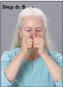
Step 6: B