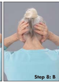
Step 8: B